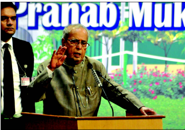
President Pranab Mukherjee delivering the speech at the function at Rabindra Sadan