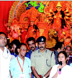
Chief minister Mamata Banerjee inaugurating Durga puja of Mandiratala in Hoorah — Shyamal Maitra

Kohli urges high-flying India to be 'ruthless' — See Page-12