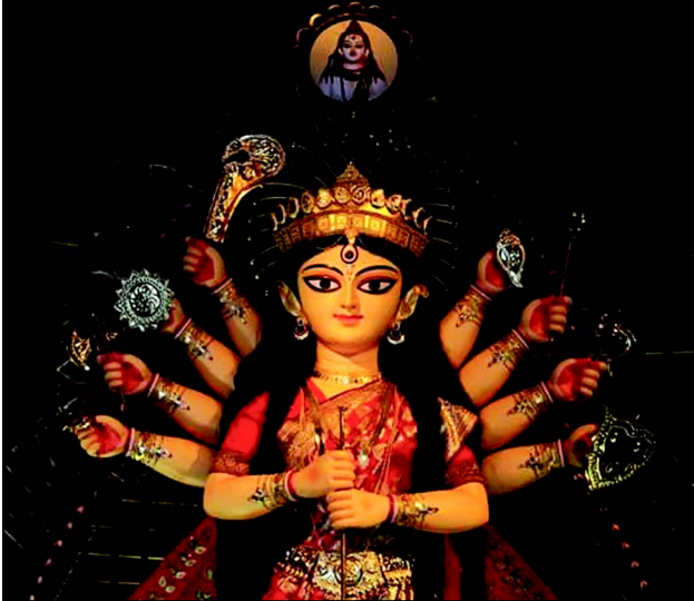
Goddess Durga at Ajeya Sanhati

Defence Minister Manoj Siiharaman and her US counterpart James Mattis held comprehensive talks covering the entire gamut of the bilateral defence partnership. "The situation in our neighbourhood and the growing menace of cross-border terrorism were discussed in depth. There is growing convergence in the approaches of both our countries on this issue," Siiharaman said at a joint press conference. She said both sides recognise the importance of holding those who use terrorism as an instrument of state policy to account and to dismantle the infrastructure that supports terrorism. On his part, Mattis said there can be "no tolerance to terrorism safe havens." He also welcomed India's role in Afghanistan where it is involved in several development projects, however, he ruled out troops contribution amidst the US emphasis for a greater participation by the country in the conflict-ridden Islamic nation. "We have made it clear that there shall not be boots from India on the ground (in Afghanistan)," Siiharaman said while responding to a query on whether India will contribute troops in Afghanistan. The defence minister also said that Mattis has assured her that he will raise with Pakistan the issue of terrorism emanating from there.