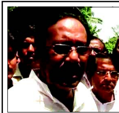
Tapan Dasgupta, minister for agricultural marketing

gust 30, 2016 that asked the state government to return all the 997 acres of land belonging to Singur farmers, the state government started working on it on a war footing and returned almost the entire land to all farmers—both willing (those who received cheques) and unwilling, in about three months time. And the state government cites interest of the farmers and their sacrifice and sustained struggle against forcible land acquisition as reason behind the gesture. "It is under the instruction of our chief minister Mamata Banerjee that the compensation to the farmers is still being given...and it will be continued...we have their interest in our mind, think of their struggle for 10 years, the immense sacrifice they made and in comparison the money is too small," Tapan Dasgupta, minister for agricultural marketing, told Echo of India.