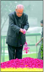
Former President Pranab Mukherjee paying tribute to former Prime Minister Indira Gandhi on her 33rd death anniversary. in New Delhi on Tuesday

NEW DELHI, OCT 31 /-/- Prime Minister Narendra Modi, his predecessor Manmohan Singh and former president Pranab Mukherjee paid tributes to Indira Gandhi on her 33rd death anniversary. "Tributes to former PM Mrs Indira Gandhi on her death anniversary," Modi said in a tweet. Mukherjee, Singh and Congress vice-president