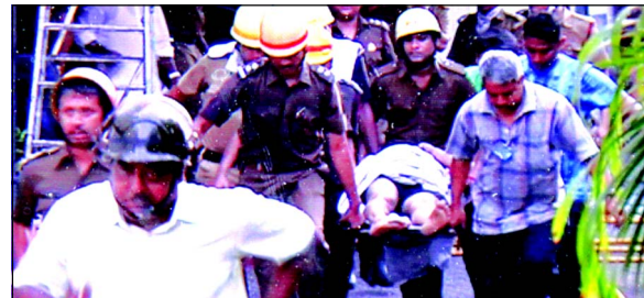
(T-B) Broken window panes of the hotel that caught fire. Fire brigade officials bringing out an injured person from the hotel on Ho Chi Minh Sarani