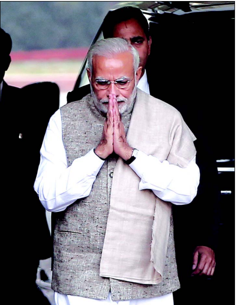
Prime Minister Narendra Modi gestures as he walks to speak with the media after arriving at Parliament on the first day of the winter session in New Delhi