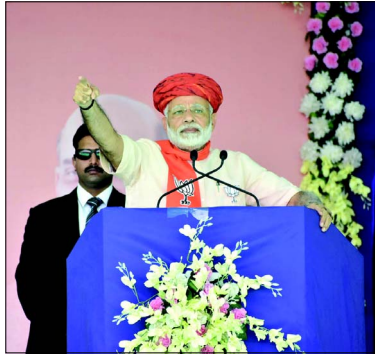
(Left to right) Congress Vice President Rahul Gandhi offering prayers at Somnath Temple. Prime Minister Narendra Modi addressing Gujarat Vikas Rally as part of the election campaign for the upcoming state assembly polls in Morbi on Wednesday.