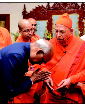
President Ram Nath Kovind meeting President of Ramakrishna Mission and Math at Belur Math in Howrah