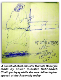
A sketch of chief minister Mamata Banerjee made by power minister Sobhandeb Chatterjee while she was delivering her speech at the Assembly today

EOI CORRESPONDENT KOLKATA, NOV 29 /-/ For the first time since BJP leader Mukul Roy triggered the controversy over the logo of Biswa Bangla at a party rally on November 16, the government has made the personal property of Mamata's nephew and party MP Abhishek Banerjee, the chief minister today said it was matter of Bengal's pride and in future all brands to be showcased by the West Bengal government would have the brand of Biswa Bangla. Mamata said this today in the state Assembly where the Opposition staged a walk-out on Tuesday after the government tabled the Biswa Bangla university bill. They alleged since there was controversy going on regarding it and cases were filed in High Court, the government should have refrained from tabling the bill. "I felt bad about it. Biswa Bangla is a matter of pride