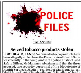
Seized tobacco products stolen