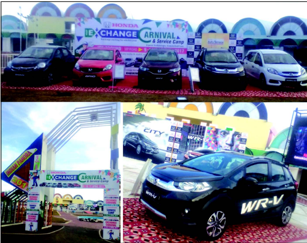
Collage shows Honda Cars on display at Honda Exchange Carnival at IFF Ground here on Tuesday. Owners of several cars of other automobile companies got their vehicles exchanged for Honda models since Sunday. Honda's star-est launch, compact crossover model WR-V and City 2017 remained the top attractions during the carnival.

junior level leadership by exposing them to strategic matters and kindling inquisitiveness among them.