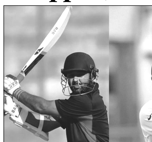
Patel's swap with Wriddhiman Saha. Murali Vijay, meanwhile, got injured during the final Test and wasn't able to retain his spot for the single Ranji Trophy quarterfinal. After assuring the selection committee of his fitness in the inter-state T20 tournament, he has been able to retain his spot for the single Test series. Mukund has been a steady scorer with over 700 runs in Ranji Trophy for Tamil Nadu and will return to the national team dressing room after

NEW DELHI, JAN 31 -- Led by chief selector MSK Prasad, BCCI selection committee today announced the squad for India's Test against Bangladesh. Wicket-keeper batsman Parthiv Patel, who led Gujarat to their first Test victory triumph by beating Mumbai in the final, was dropped in favour of established glove-wearer Ishant Sharma. India's complete squad: Virat Kohli (c), KL Rahul, Murali Vijay, Cheteshwar Pujara, Ajinkya Rahane, Wriddhiman Saha, Ravichandran Ashwin, Ravindra Jadeja, Jayant Yadav, Ishant Sharma, Umesh Yadav, Amit Mishra, Abhinav Mukund, Bhuvneshwar Kumar, Kedar Nair and Hardik Pandya.