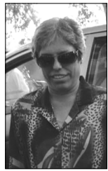
An IPL team linked to its former head N a r a y a n a s w a m i Srinivasan. Charges of corruption and nepotism dented the BCCI's image in recent times, leading many activists to urge India's top court to intervene to reform the privately-run organisation. The Supreme Court earlier this month sacked the BCCI's two most senior officials for failing to implement reforms aimed at improving governance and transparency. Edulji, who joins prominent historian Ramachandra Guha, Mumbai-based banker

The first step we have to take is to get the house in order," Edulji, who played 20 Tests and 34 one-day international for India between 1976 and 1989, told AFP outside her home in Mumbai. "Let's hope we can bring justice and bring BCCI back to its glorious days," added the 61-year-old, saying it was time for Indian cricket to "look ahead" after years of turmoil. The Supreme Court's appointment of the panel, headed by former government auditor Vinod Rai, was the latest development in its BCCI shakeup. The board has been embroiled in a series of scandals, including accusations of corruption in the Indian Premier League (IPL) and a betting scandal involving