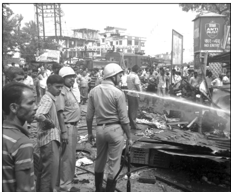
Firefighters dousing fire that gutted two shops in siliguri

the BJP of deviating from its commitments it had made to the public and alleged that the saffron party does not care about the people. "The BJP makes public commitments and then deviates from all. They only care about money," Mamata wrote on her Twitter handle this afternoon. Questioning the BJP's commitment to the society, she wrote: "How can the BJP not carry out their social obligations? Where is their commitment to society at large? I am really concerned about the common people. The subsidy was withdrawn on LPG and now again, BJP does not care about the people," she added.