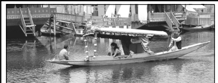
Tourists enjoying a Shikara ride in the Dal Lake in Srinagar on Monday