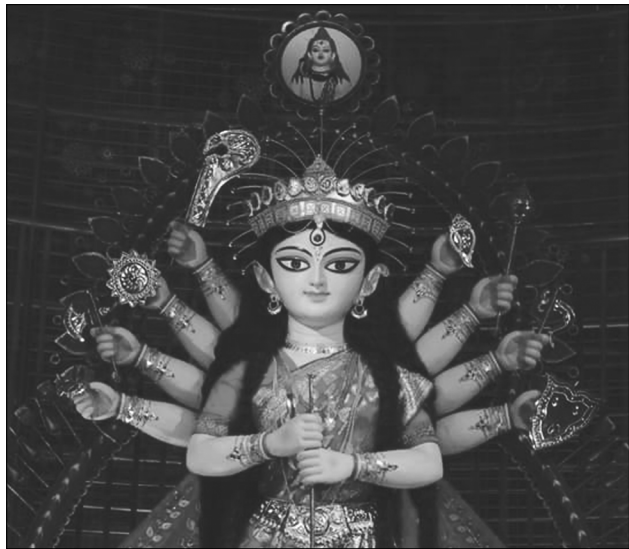
Goddess Durga at Ajeya Sanhati