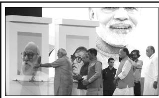
Prime Minister Narendra Modi paying floral tributes to Nanaji Deshmukh, to commemorate the Birth Centenary Celebrations of Nanaji Deshmukh, in New Delhi on Wednesday.