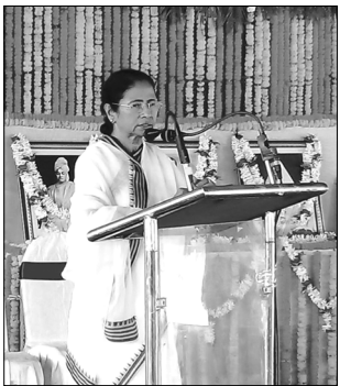
Chief minister Mamata Banerjee addressing a public rally at Jhargram