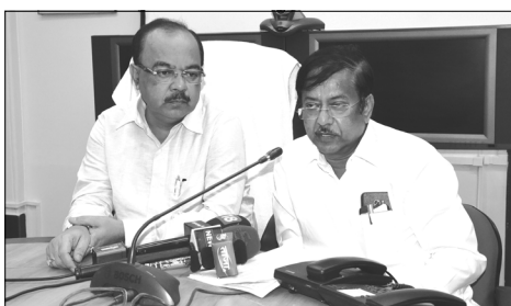
Mayor Sovan Chattopadhyay and state food minister Jyotipriyo Mullick at a meeting on distribution of digital ration cards under Khadya Sathi scheme at KMC