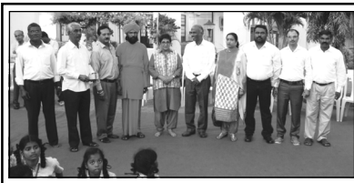
Picture shows the media team from these islands calling on the Lt. Governor of Puducherry, Kiran Bedi on Saturday.