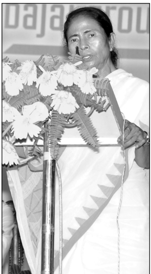
Chief minister Mamata Banerjee at the inauguration of Kamal Nayan Shankar Netralaya at Rajarhat