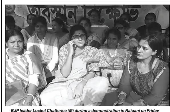
BJP leader Locket Chatterjee (M) during a demonstration in Raiganj on Friday