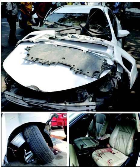
Mangled car with inflated wheel of actor Vikram Chatterjee and model Sonika Chohan, who died after the car they were travelling in met with an accident at Rashbehari. Blood stains are also seen on the seat

ing. Vikram and Sonika, who were on the driver's seat and front seat respectively, were brought out from the mangled car by locals and rushed to a private hospital, police said. While Sonika was declared dead, Vikram was admitted to a hospital, police said. A pall of gloom descended as the news of the mishap spread and many Bengali film actors including Dev rushed to the hospital on EM Bypass. A hospital doctor said Vikram was stable now and shifted to general bed from ICU after CT scan. He had injuries on head, leg, and other parts of body, the doctor said. Sonika, a popular face in city and Mumbai modelling circuits, had also been hosting a prime time show on a national channel. Vikram, whose last film Khoj (The Lost) had been screened in several film festivals, had also acted in 'Elar Char Adhyay' and 'Ami Ar Amar Girlfriends' (PTT)