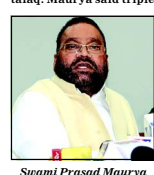
Swami Prasad Maurya

BASTI (UP) APRIL 29 /- UP cabinet minister Swami Prasad Maurya has charged that Muslims use triple talaq to change wives and satisfy their "lust", remarks that are likely to spur a controversy. The BJP minister's comments come at a time when there is a raging debate over the issue of triple talaq. Maurya said triple