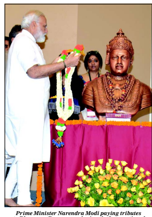
Prime Minister Narendra Modi paying tributes to Bhagavan Basavanna during the International Basava Convention on the occasion of Basava Jayanthi, in New Delhi on Saturday.

Lingayats are a formidable community. Basaveswara, also known as Basavanna, is their most powerful icon. The prime minister used the platform, hosted by the Basava Society to repeat his government's message of "Sabka Saath Sabka Vikas" (Development for all) and said people had to progress without discrimination. "People should get homes, access to power without discrimination. Farmers should get fertilisers and insurance benefits without any distinction. That is the meaning of our government's message of 'Sabka Saath Sabka Vikas'," he said. Interspersing his 40-minute address with the sayings of the poet-philosopher, he said today's youth were