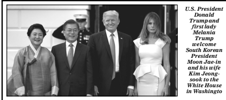
U.S. President Donald Trump and first lady Melania Trump welcome South Korean President Moon Jae-in and his wife Kim Jeong-sook to the White House in Washington