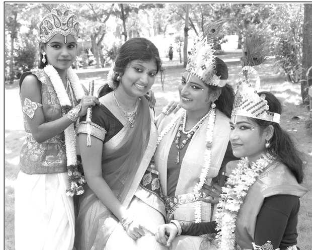
Students dressed up as Lord Krishna and other Hindu God's performing during Krishna Jayanti celebration, at MGR Janakai Womens College, in Chennai on Friday.

They must interpret corruption laws in the context of the spirit of the law and in favour of the state and the society rather than in the interests of the offenders, which they often end up doing on the pretext of saving one innocent even if a thousand guilty go scot free. The charity has to end at some point. (IPA)