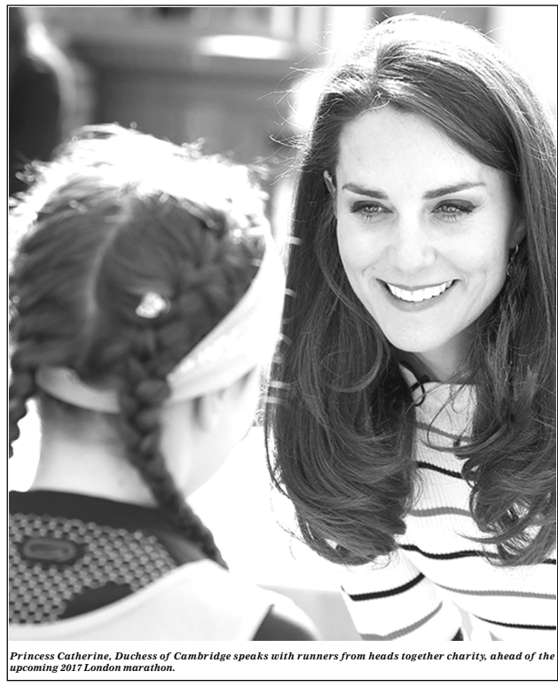
Princess Catherine, Duchess of Cambridge speaks with runners from heads together charity, ahead of the upcoming 2017 London marathon.

The hallmark of a genuine politician is the possession of genuine compassion and humility. Unfortunately, Pinarayi Vijayan has exposed himself to the charge of lacking both. This is an impression which he must erase at the earliest. That the police should run amok when a communist government is in power is unpardonable. The Government must act and act now - to ensure that the police become people-friendly and people-hostile. The LDF Government has been forewarned. It must read the writing on the wall and mend its ways. (IPA)