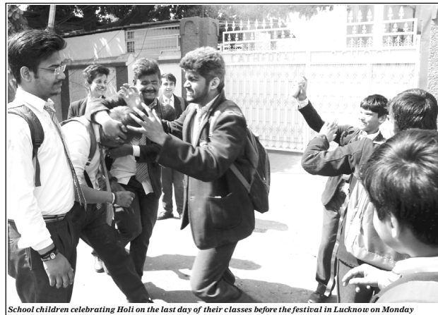
School children celebrating Holi on the last day of their classes before the festival in Lucknow on Monday

And the director of the top Iraq and Afghanistan veterans' group told Politico the parade "is definitely unpopular" among his members because it could politicize the military