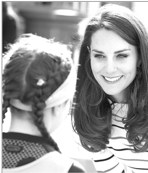
Princess Catherine, Duchess of Cambridge speaks with runners from heads together charity, ahead of the upcoming 2017 London marathon.

The hallmark of a genuine politician is the possession of compassion and humility. Unfortunately, Pinarayi Vijayan has exposed himself to the charge of lacking both. This is an impression which he must erase at the earliest. That the police should run amok when a communist government is in power is unpardonable. The Government must act and act now - to ensure that the police become people-friendly and people-hostile. The LDF Government has been forewarned. It must read the writing on the wall and mend its ways. (IPA)