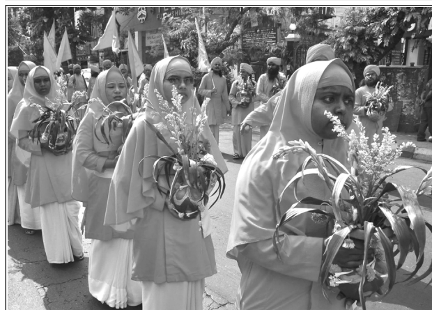
Ananda Marga Pracarak Samgha take out a silent procession at Deshpriya Park to Bijan Setu to pay homage to the 17 Sanjayis and Sanjayis who were killed on April 30, 1982 in Kolkata on Sunday.