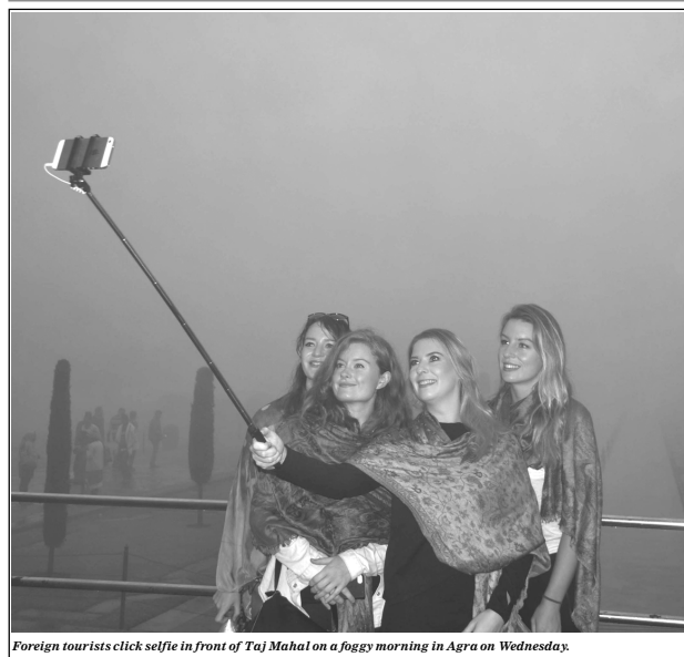
Foreign tourists click selfie in front of Taj Mahal on a foggy morning in Agra on Wednesday.

Bangladesh is exploring all avenues for its speedy development. India will have to extend its hand of cooperation to Bangladesh to the best possible extent to protect its interests as best as it can. (IPA)