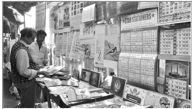
A person looks at New Year greetings cards and calendars being sold at a roadside stall today

As the year draws to a close, the situation does not appear to be easing for the harrowing public as the restrictions for withdrawing one's own money might persist till the process of re-monetizing the economy is complete. While nobody grudges draconian actions against errant elements in the economy who profit by their nefarious activities, the ramifications and repercussions need to be duly reckoned lest the public at large do not feel short-changed or subject to undue inconvenience. Many doubt whether the blizzard of demonetisation would do subsides soon to enable people to resume their normal life. Even assuming that its deleterious effects would be lived down by the forgiving public if only it purges the economy of all odious and obnoxious dregs, the picking up process would be a long drawn out exercise with many normal people finding the existence enervating enough. So as the New Year is all set to dawn, hope springs eternal that the hardships of the recent weeks would be behind and that better days would herald India's tryst with destiny for a sustainable development. (IPA)