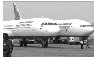
Over 45 unserved and under-served airports would be connected under the scheme - UDAN (Ude Desh aur Aam Nagrik) that seeks to make flying more affordable. Announcing the names of winning bidders and the routes, Civil Aviation Secretary R N Choubey today said 128 routes are being awarded to 22 airlines. The operators are Air India subsidiary Air India Express, SpiceJet, Air Deccan, Air Odisha and Turbo Mega. They would be operating 19-78 seater aircraft. The airports that

NEW DELHI, MARCH 30 /-/- Five airlines will operate on 128 routes under the regional connectivity scheme wherein fares are capped at Rs 2,500 for one-hour flights.