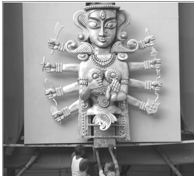
A Durga puja pandal is being decorated ahead of the puja in New Delhi on Monday.