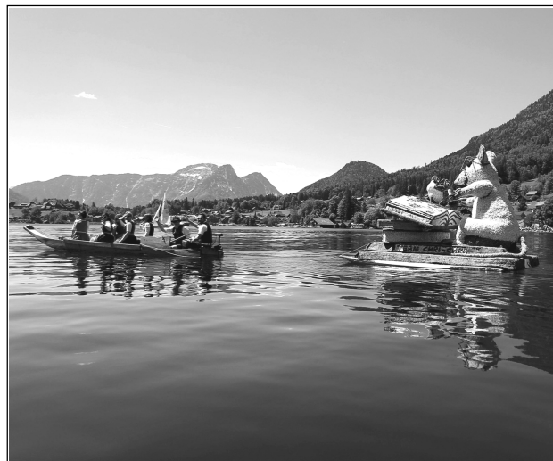
A float, decorated with a figure made of daffodil blossoms, participates in a parade during the daffodil festival (Narzissenfest) on Grundlsee lake in Grundlsee, Austria.

Surely, if Mr Rajnikanth takes a plunge, seeking to change a murky scene, it could mean a major challenge to the bipolar Dravidian political order that has prevailed for decades, with all its credits (social empowerment and overall development) on one side and the abhorrence that corruption and other evils were built into the system, on the other. (IPA)