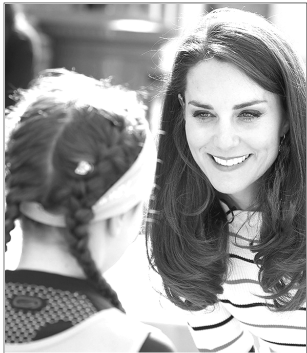
Princess Catherine, Duchess of Cambridge speaks with runners from heads together charity, ahead of the upcoming 2017 London marathon.

The hallmark of a genuine politician is the possession of compassion and humility. Unfortunately, Pinarayi Vijayan has exposed himself to the charge of lacking both. This is an impression which he must erase at the earliest. That the police should run amok when a communist government is in power is unpardonable. The Government must act and act now—to ensure that the police become people-friendly and people-hostile. The LDF Government has been forewarned. It must read the writing on the wall and mend its ways. (IPA)