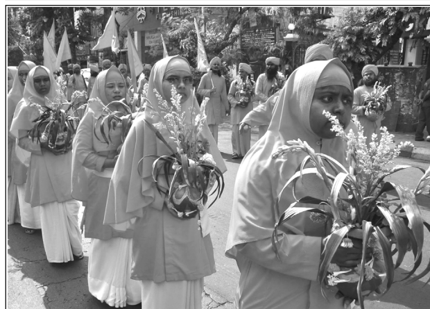
Ananda Marga Pracarak Samgha take out a silent procession at Deshpriya Park to Bijan Setu to pay homage to the 17 Sanjayinis and Sanjayis who were killed on April 30, 1982 in Kolkata on Sunday.