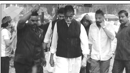
Amitabh Bachchan comes to pay his respects to his Deewar co-star.