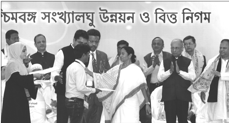
Chief Minister Mamata Banerjee honoring over scholarship to a student at the function organised by the department of minorities of the state government —Arijit Ganguly