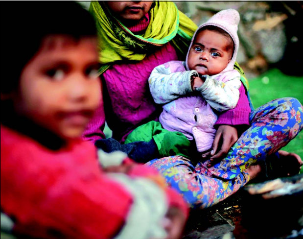
A girl holds her brother as she sits next to a fire along a roadside on a cold winter morning in New Delhi