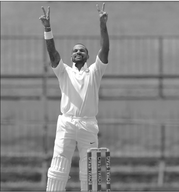
Shikhar Dhawan celebrated his sixth Test hundred with a peace out (or victory?) gesture at the Indian team dressing room

PALLEKKELE, AUG 12 /- Shikhar Dhawan continued his golden run but a rare flop show from the famed middle-order saw Sri Lanka restrict India to 329 for 6 here on the first day of third cricket Test.