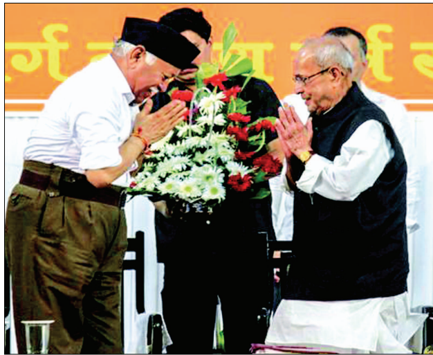
Former President Pranab Mukherjee with RSS chief Mohan Bhagwat at the closing ceremony of 'Tritiya Varsha Sangh Shiksha Varg' in Nagpur on Thursday