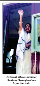
External affairs minister Sushma Swaraj waves from the train