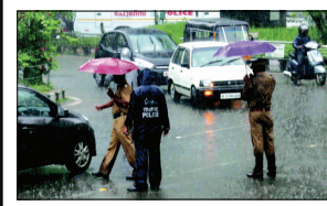
Police personnel using umbrella to protect themselves from monsoon rain while maintaining traffic, in Thiruvananthapuram on Thursday

PORT BLAIR • FRIDAY • JUNE 8, 2018 • PAGE-7