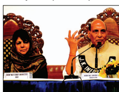
Jammu and Kashmir Chief Minister Mehbooba Mufti and Home Minister Rajnath Singh attend a news conference in Srinagar

had initiated several schemes to help them secure their future. "I want to appeal to the youth that they should take