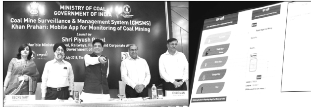
Union Minister for Railways, Coal, Finance and Corporate Affairs Piyush Goyal launching the Mobile App "Khan Prahari", at a function, in New Delhi. Secretary, Ministry of Coal Inderjit Singh and other dignitaries are also seen.