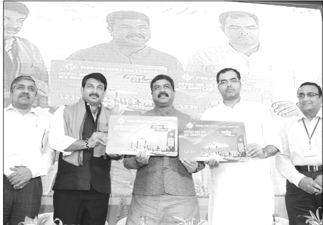
Union Minister for Petroleum & Natural Gas and Skill Development & Entrepreneurship Dharmendra Pradhan launching IGL Smart Card, prepaid CNG cards for both retail and fleet customers, in New Delhi. Members of Parliament Manoj Kumar Tiwari and other dignitaries are also seen.

from the retailer as subsidised rate and the transaction details will be recorded on the Point of Sale (POS) machines. The POS machines have been completed so far. There is no short supply of the machines. We hope all states to complete the exercise soon," he added. The DBT for fertiliser subsidy is being implemented from October 11 in seven states/UTs: Mizoram, Nagaland, Delhi, Puducherry, Goa, Daman and Diu, and Dadra and Nagar Haveli. Another dozen states have been short-listed for launch next month. "We are doing an exercise how much load our system can take. Accordingly, we will add more states in phased manner. We intend to cover the entire country by January 2018," the official noted. (PTI)