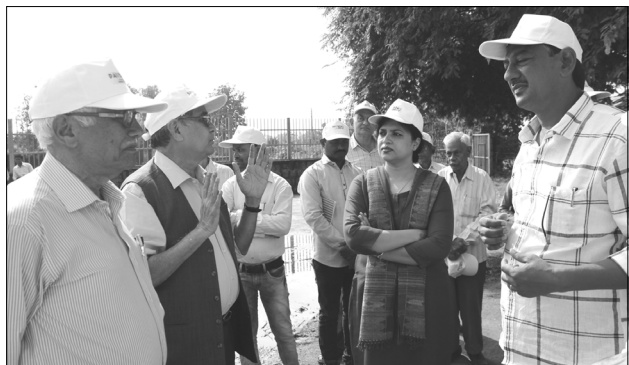
A Heritage Walk was organized at Sirpur on the occasion of Tourism Fortnight by the Chhattisgarh Parayatna Mandal supported by Union Tourism department.—EOIPIKs

PUNE, OCT 11 /- Aurangabad-based auto components maker Dhoot Transmission has made a foray into the electro-mechanical and electronic switches for the two and three-wheeler industry through an equal JV with US-based Carling Technologies, investing Rs 65 crore in a 1-million units plant. The joint venture will cater to the fast growing two-wheeler and three-wheeler market, as well as commercial vehicles, agricultural and construction equipment segments and will also be exported overseas through Carling's global distribution network, the companies said here on Wednesday. The JV partners said the greenfield facility coming up on an 8-acre plot in Aurangabad will be operational in the first half of 2018 and will employ around 300 people in the first phase which can go up to 1,000 over the next three years as it sees a massive growth in demand for its products with the introduction of BS-IV norms. Though the JV partners refused to share financial details, citing confidentiality clause, it has been learnt from industry sources that in the first phase, which will have a million unit capacity, the JV will invest Rs 65 crore which will go up over the next three years to Rs 100-150 crore.