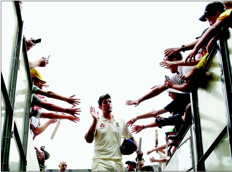
Alastair Cook takes the applause as he leaves the field, Australia v England, 4th Ashes Test, Melbourne, 3rd day.