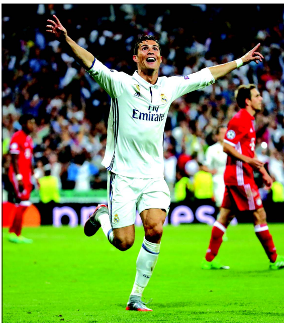
Cristiano Ronaldo celebrates scoring their third goal to complete his hat-trick

However, after Arturo Vidal was sent off, Ronaldo hit the century mark in Europe's top club competition on 104 minutes and completed his hat-trick five minutes later. Bayern were left incensed, though, as Ronaldo's second and third goals were clearly offside. "To score six goals against a team like Bayern Munich isn't easy so we deserved to go through," the Portuguese striker told Spanish TV station Antena 3. "Real Madrid is Real Madrid, we are used to suffering and we are happy to be in the semis once again." Marco Asensio gave a night of high-class action the finale it deserved with a sensational solo goal to rub salt in Bayern wounds. "The (red) card for Arturo wasn't a card and then the two goals from