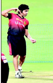
KKR captain Gautam Gambhir, Sunil Narine and Suryakumar Yadav inspect the pitch in a practice session at Eden Garden in Kolkata

With the team getting well and enjoying a winning momentum, there may not be any need to tinker KKR's line-up but in hindsight it is perplexing to see star Bangladeshi all-rounder Shakib Al-Hasan warming the bench. Andre Russell's replacement Colin de Grandhomme has failed to make much impact from three games and Shakib may give a better overseas option to skipper Gautam Gambhir. Their smooth campaign so far, notwithstanding, KKR would be worried about the