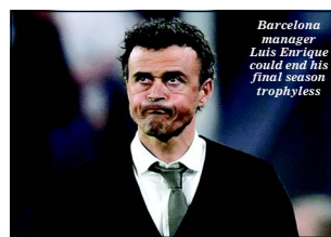
Barcelona manager Luis Enrique could end his final season trophyless

Neymar left the field in tears, but around the Camp Nou there was appreciation for Barca's valiant effort by the near 100,000 crowd. 'It's a sad night, but we tried until the last minute and that was recognised by the fans at the end,' said Enrique, who will step down at the end of the campaign. 'This is (a) team that never gives up, that fights for every title, doesn't relax and always accepts the challenge. 'It is a joy to belong to a club like this.' Barca travel to face eternal rivals Real Madrid in El Clasico on Sunday realistically needing to win to maintain their hopes of a third straight La Liga title. Madrid led by three points at the top of the table, but also have a game in hand. Barca have a team built to compete, to win trophies and to face every challenge. 'It is clear we are very hurt to be eliminated from a competition that excites us so much, but now comes a key game against the leaders and a direct rival. 'We have to get ready to compete and I am sure we will do that.' Barca will be without Neymar at the Bernabeu