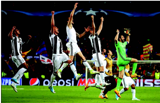
Juventus' Gianluigi Buffon celebrates with teammates after the match