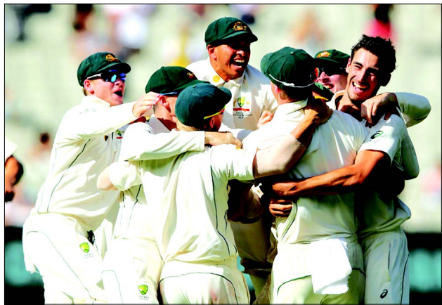
Australia celebrate their victory