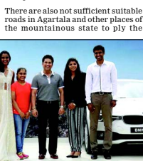
Dipa Karmakar with Sachin Tendulkar and a BMW car.

AGARTALA, DEC 30 -- Star Indian gymnast Dipa Karmakar has returned the BMW presented to her by Sachin Tendulkar after the Rio de Janeiro Olympics, and has bought a Hyundai Elantra with the Rs 25 lakh she received. The 22-year-old, who was presented the BMW by Tendulkar as a gesture of appreciation for her fine show at Rio, returned the luxury car due to the poor condition of roads in Agartala. Another reason for Dipa doing away with her brand new car was the absence of a service centre in her hometown. The BMW which was handed over to Dipa by Tendulkar, was in fact gifted to her by the Hyderabad District Badminton Association. There is no showroom or service centre of BMW car in Tripura. If the car developed any technical snag during driving, how would I repair this?