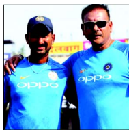
James Anderson is 'biggest sledger', says Steve Smith

NEW DELHI, DEC 1 /- India's chief coach Ravi Shastri feels that Test specialist Cheteshwar Pujara should remain in the top bracket when the BCCI and Committee of Administrators (COA) thrash out the revised central contracts based on new remuneration structure. Pujara is currently in the Grade A of Central Contracts alongside Virat Kohli, Mahendra Singh Dhoni, Ravichandran Ashwin, Ajinkya Rahane and Murali Vijay. During a panel discussion on journalist Rajdeep Sardesai's new book 'Democracy's XI', Shastri said: "It is very important that someone like Cheteshwar Pujara is kept in the top bracket of central contract." Shastri, along with Kohli and Dhoni, met CoA chief Vinod Rai to discuss the revised remuneration package and Future Tours & Programme (FTP)