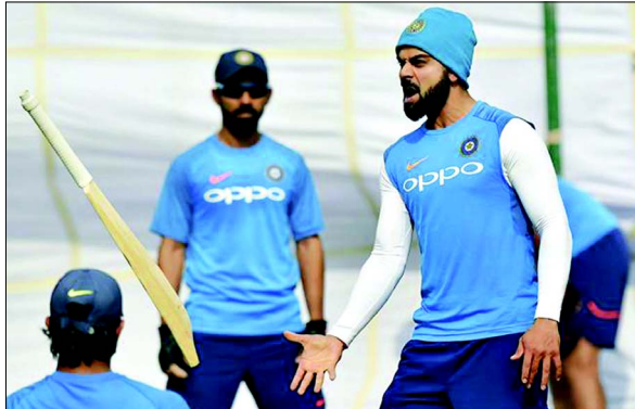
Virat Kohli during a practice session in New Delhi on Friday

Add to it, the absence of their injured veteran left-arm spinner Rangaana Herath has left the island nation look like a rudderless ship. Herath, with figures of 1/81 in 29 overs, was the only bowler who the Indians treated with respect during their innings and 239-run win in the second Test in Nagpur. Even worse, Angelo Mathews, who was supposed to take Sri Lanka cricket to the next level, has been woefully out of form. The Perozh Shah Kotla track may not be as flat as the one at Jamtha, where India scored 610/8 declared but it also won't be a green top like the one they got at the Eden Gardens. Ishant Sharma, who had a match-haul of five wickets, would like to retain his place in the side even if Mohammed Shami gets injured. The last time a Test match was held at the Kotla in 2015, it was rated as the best pitch as the match against South Africa went deep into the fifth day. But the current Sri Lanka side does not possess the kind of guts and gumption that Hashim Amla, Temba Bavuma and AB de Villiers displayed, which precisely is the reason that all and sundry are bracing for a quick finish.