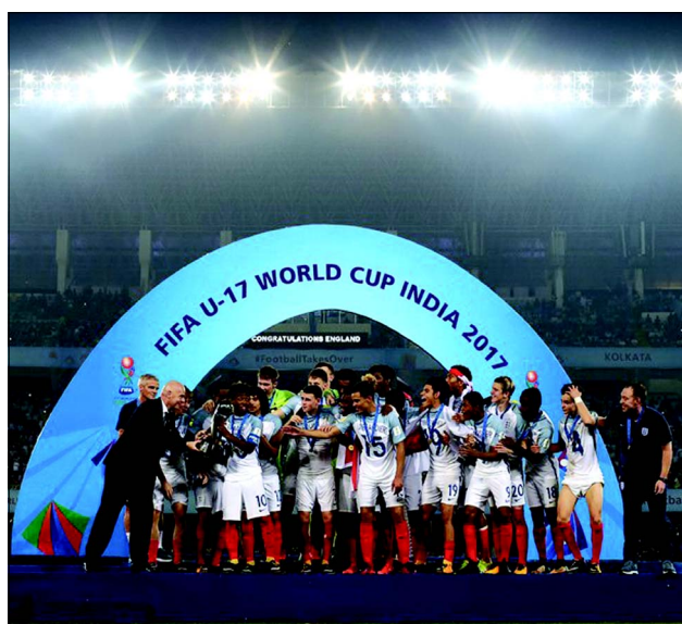
FIFA President Gianni Infantino delivers the champion trophy to the captain Angel Gomes of England after the FIFA U-17 World Cup India 2017 Final match between England and Spain at Vivekananda Yuba Bharati Krirangan

that has to be worked on. We used to be finishing school for players. It would be a shame if these players have to go to the continent to get their chance," he said. Liverpool's Rhian Brewster scored eight times in the under-17 World Cup, while Manchester City's Phil Foden netted twice against Spain and was voted player of the tournament. Back at their clubs, Brewster and Foden won't find it easy to break into teams loaded with attacking talent. But City boss Pep Guardiola offers hope, saying: "Phil has been with us since the beginning of the season and played unbelievable against Manchester United and Real Madrid. "He trains with us every single day. He's just 17 but he is a player in our squad." Some critics claim young English players are too pampered by their clubs, and a coterie of agents and hangers-on, to focus sufficiently on honing their trade. But England under-17 boss Steve Cooper insists the current success story has shot down that theory. "The young players we are bringing into our teams are a credit to their generation," he said. "Sometimes they get a bit of a tough stick, too much too-son and things like that. If you see how they train, how hard they work, they show so much respect. (AFP)