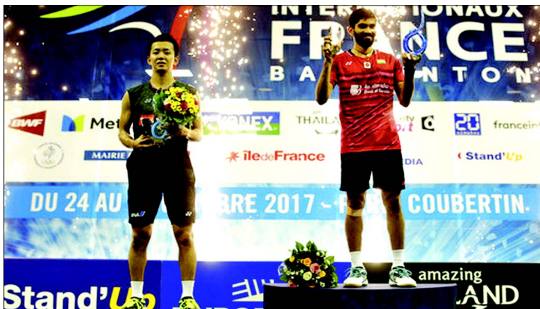
Kidambi Srikanth is the first Indian badminton player to win four Superseries titles in a year

HYDERABAD, OCT 31 /- / In the best form of his life, the winning four Super Series titles in five months, star Indian shuttler Kidambi Srikanth said that the days of domination of Lin Dan or Lee Chong Wei are over and the tournaments are more wide open than ever. Srikanth, who became the first Indian and only fourth men's singles player in the world to win four Super Series titles in a calendar year, said not a few but many players, including him, are capable of winning top tournaments these days. "For a long time I think (Malaysian) Lee Chong Wei and (China's) Lin Dan have dominated badminton. And now it has become more open. Me, Viktor (Axelsen) and even other Indian players are winning tournaments. It has become more wide open and it's always good for the sport when you have so many champions," he told