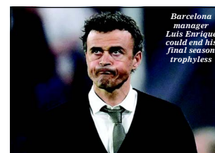
Barcelona manager Luis Enrique could end his final season trophyless

Neymar left the field in tears, but around the Camp Nou there was appreciation for Barca's valiant effort by the near 100,000 crowd. 'It's a sad night, but we tried until the last minute and that was recognised by the fans at the end,' said Enrique, who will step down at the end of the campaign. 'This is (a) team that never gives up, that fights for every title, doesn't relax and always accepts the challenge. 'It is a joy to belong to a club like this.' Barca travel to face eternal rivals Real Madrid in El Clasico on Sunday realistically needing to win to maintain their hopes of a third straight La Liga title. Madrid led by three points at the top of the table, but also have a game in hand. 'Barca have a team built to compete, to win trophies and to face every challenge. 'It is clear we are very hurt to be eliminated from a competition that excites us so much, but now comes a key game against the leaders and a direct rival. 'We have to get ready to compete and I am sure we will do that.' Barca will be without Neymar at the Bernabeu