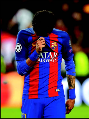
Barcelona's Neymar looks dejected after the match.