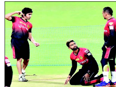
KKR captain Gautam Gambhir, Sunil Narine and Suryakumar Yadav inspect the pitch in a practice session at Eden Garden in Kolkata