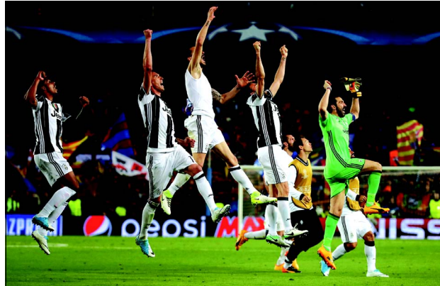
Juventus' Gianluigi Buffon celebrates with teammates after the match.