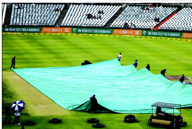
Rain kept the groundstaff busy, 1st Test, Cape Town

All-rounder Mitchell's first test hundred came after he was called into the team for the third Ashes clash in Perth and was a reward for the hard work he did on his batting after his recuperation from surgery. "To be honest I really didn't think I was going to play any part for Australia this summer," he said.