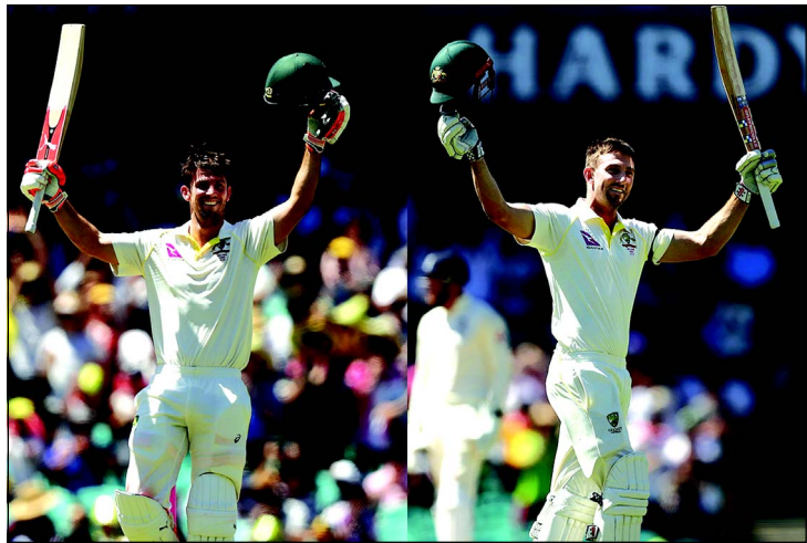
(Left to right) Mitchell Marsh made his second Test century. Shaun Marsh reached his hundred in the opening over of the day

England 346 and 4 for 93 (Root 42*, Bairstow 17*) trail Australia 7 for 649 dec (Khawaja 171, S Marsh 156, M Marsh 101, Smith 83, Warner 56) by 210 runs