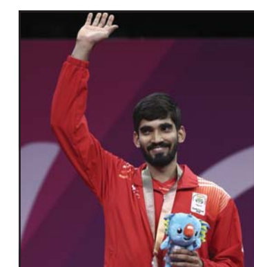
Silver medalist Srikanth Kidambi of India waves during the medal ceremony

GOLD COAST, APR 15 /--/ Newly-crowned World No.1 Kidambi Srikanth let slip the early advantage to settle for a silver medal in the 21st Commonwealth Games, going down to Malaysian legend Lee Chong Wei in the men's singles summit clash here today. Srikanth had beaten Lee in the mixed team championships final earlier in the Games but the former world number one rallied for a 19-21 21-14 21-14 triumph today for his third individual CWG gold. He has two more mixed team gold medals to his credit. A decade older than the Indian, Lee kept his best for the last, showing off the legendary reflexes that have earned him cult status in international badminton. But it was not all smooth sailing for him today as Srikanth started off confidently. It took Srikanth just eight minutes to go from being 0-4 down to be 10-7 ahead. The Indian was the better of the two in executing drop shots and even managed to match Lee's ability to mix power with precision. Srikanth led 11-9 at the break.