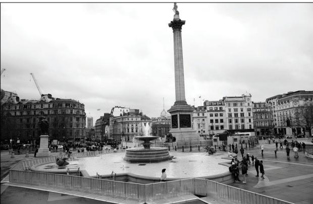
Barcades are erected in Trafalgar Square ahead of New Year's Eve celebrations in London, Britain

NEW YORK, DEC 31 /- Bono has often brushed with death but the rock star says he did not cry a river over his condition when he had one recently. The 57-year-old musician said he dealt with the death scare, which took place in the middle of recording U2's latest album "Songs of Experience," like any other "event." "It's just a thing that... People have these extinction events in their lives; it could be psychological or it could be physical. And yes, it was physical for me, but I think I have spared myself all that soap opera. "Especially with this kind of celebrity obsession with the minutiae of peoples' lives I have got out of that. I want to speak about the issue in a way that lets people fill in the blanks of what they have been through." Bono told Rolling Stone. "... By the time it (the news) gets to your local tabloid it is just awful. It becomes the question that everyone is asking," he added. The U2 vocalist had met with a bike accident in 2015 and he termed the event as a "comic tragedy" as he did not remember it. "That left me a little uneasy but the other stuff has just finally nailed me. (PTI)