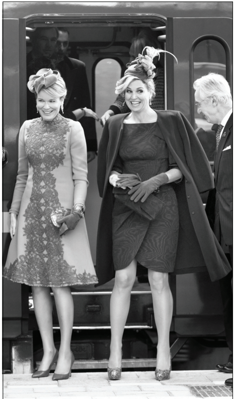
Belgian Queen Mathilde and Dutch Queen Maxima (R) disembark from a train at Utrecht central station during an official state visit to the Netherlands

LA UNION (COLOMBIA), NOV 30 /- A plane that crashed in the mountains of Colombia, killing 71 people, including members of a Brazilian football team, may have run out of fuel, a Colombian military source said. "It is very suspicious that despite the impact there was no explosion. That reinforces the theory of the lack of fuel," the source said yesterday. Six people miraculously survived the crash Monday night, but the disaster virtually wiped out an up-and-coming Brazilian football team and sent shock waves through the world of football. Football legends Pele and Maradona as well as current superstars Lionel Messi and Cristiano Ronaldo led tributes to the players of Chapecoense, Real, a humble team whose march